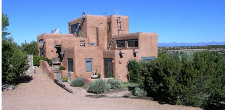
246 Camino Tres Arroyos, Santa Fe, New Mexico $489,000

This spectacular home is a two-story, three bedrooms, two baths, 2x6 construction, stuccoed, classic Santa Fe style home with corbels, vigas and wooden beams throughout. All floors on the first level are Saltillo tile. Most of the walls are hand plastered stucco style and the rest are covered by adobe brick veneer. There are four fireplaces.